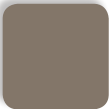
TAN METALLIC T56