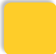
SAFETY YELLOW T93

The paint samples shown are for representation purposes only and are not a true match. Contact our Customer Service Department if actual samples are required.