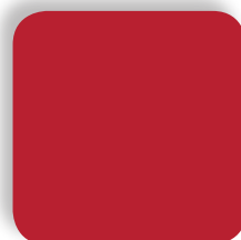
INDUSTRIAL RED T27