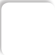
PURE WHITE T94