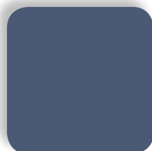
TECH BLUE T42